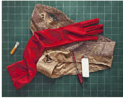
cotton embroidery floss on linen, Jacquard fabric paint Garden City, MI