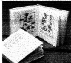
"Wildflowers of Wickham Park, Florida"

Picture yourself in a quaint little town. The trees are green. The sun is warm on your face but the breeze is cool. You notice the tables set up down the alley way. A light jazz fills the air. You are drawn to the wares. The books are calling your name.