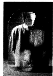
"Anne" Copyright to Susan Hensel Used by permission.

Wandering through the market, your eye is drawn to a table filled with little sculptures. A closer look brings you to the realization that they aren't sculptures at all but rather books -- amazing books. A look at the accompanying card reveals it is the work of literary sculptress, Susan Hensel . A double take surprises you with the name of the sculpture, "Anne," a tribute to Anne Sexton. The truly amazing work astounds you but you manage to pull yourself away in search of your next adventure.