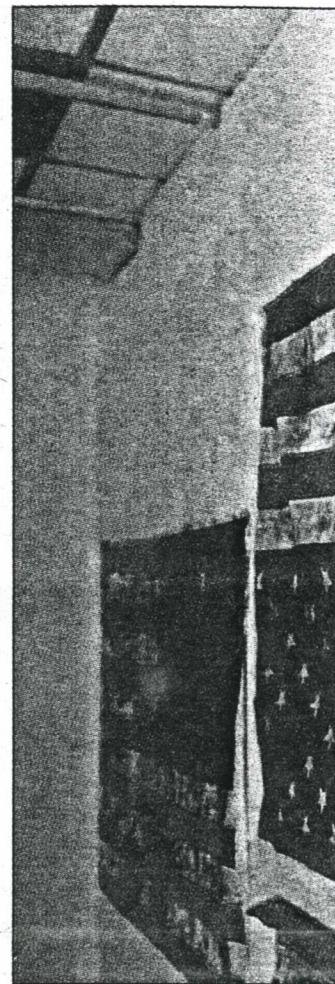
"Forever in Peace May it Wave"

showing Victor Cortez's DVD of Francis Coppola's "Apocalypse Now Redux," with all of the removed and a collage of serene landscape shots remaining.