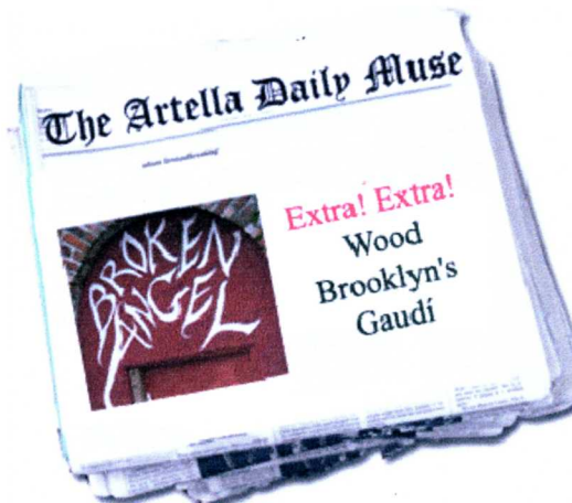
Arthur Wood Brooklyn's Antonio Gaudi

February 6th, 2007 - Brooklyn, NY - The stained-glass windows in the eccentric building, "Broken Angel", at 4 Downing Street in the Clinton Hill section of Brooklyn are made from discarded salt shakers, ashtrays and coffee tables, bottles dug up in the backyard and the detritus of neighborhood car accidents. It is only from the inside that you can see the windows' brilliant colors.