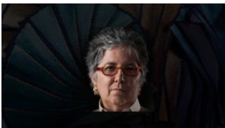
Neotectonic Period: A Radical Proposal for Beauty

( https://img.einnews.com/large/154787/special-art-exhibition-by-conte.jpeg#513x289 )