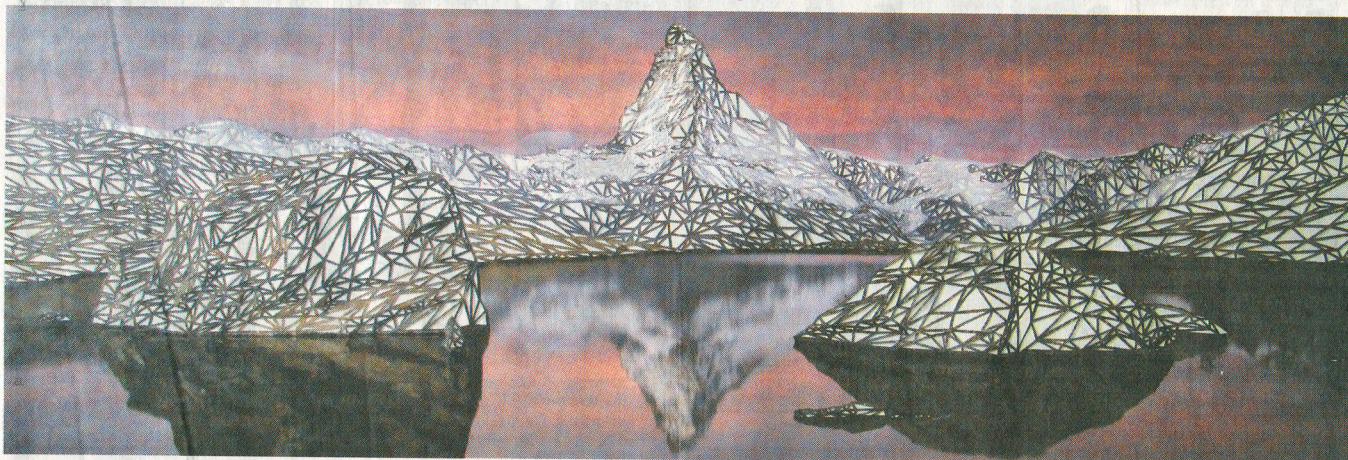
Alyssa Baguss' "Matterhorn," a landscape mural cut from wallpaper, dominates the front alcove in the "Untitled 10" exhibit at Soo Visual Arts Center in Minneapolis.

SooVAC gallery in Minneapolis samples a pool of youthful artists in a new "Untitled" show.