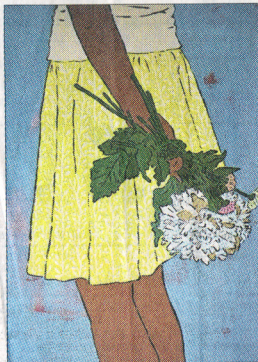
Amy Rice's "Garden Gifts"

The "Matterhorn," a landscape mural cleverly cut from wallpaper, dominates the front alcove. Start-